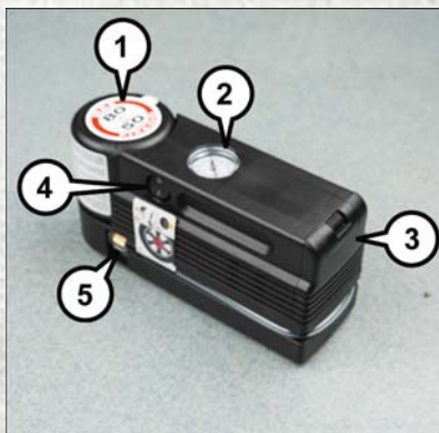
Tire Service Kit Components

If a tire is punctured, you can make a first emergency repair using the Tire Service Kit located under the passenger front seat. Tire punctures of up to 1/4" (6 mm) can be repaired; the kit can be used in all weather conditions. Do not remove the foreign object from the punctured tire, i.e., screw or nail.