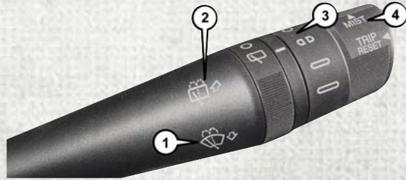
Wiper Washer Lever