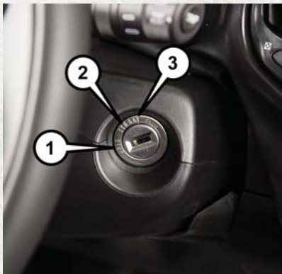
Ignition Switch Positions

The key can be turned to 3 different positions: