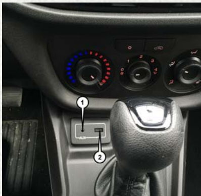
USB Port And AUX Jack