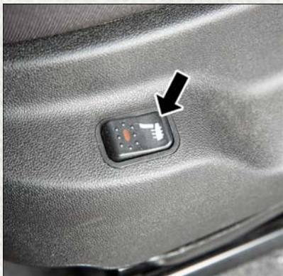
Heated Seat Switch

On some models, the front driver and passenger seats may be equipped with heaters in both the seat cushions and seatbacks. The controls for the front heated seats are located on the lower outboard side of the seat.