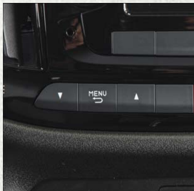
Instrument Cluster Display Controls

Not all menus are available when the vehicle is in drive. The vehicle must be in park to access all menu screens.